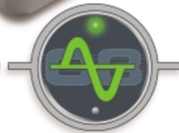
Initiate auto-commissioning routine